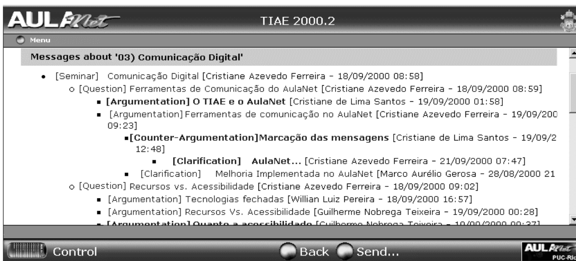
Figure 2. A dialogue within an Interest Group showing the structuring of the messages

During the semester, it was noted that this set of categories were used basically for exhibiting ideas and posting notices, not offering mechanisms for debating the topics in depth. To solve this difficulty and to stimulate interaction in the Discussion Group, three more categories were offered. Based upon the IBIS proposal [10, 11], the categories offered were Question, to propose questions and discussion topics; Position, to express a point of view answering a question; and Argumentation, to supply the reasons for the position.